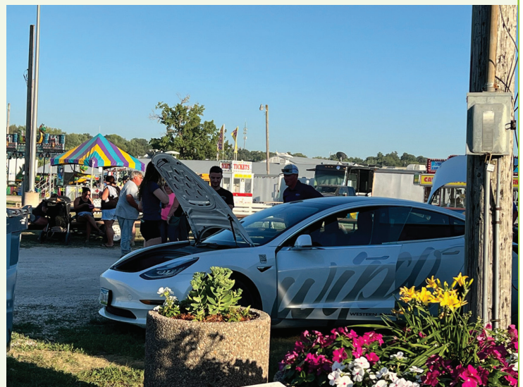
WIPCO donates and participates as part of cooperative principle #7 - concern for community. Pictured is a WIPCO employee working at the 2022 Crawford County Fair.

It's also very important to note that this culture does not end when our employees leave work each day, or when our directors adjourn a WIPCO board meeting. Chances are you've seen WIPCO employees and directors volunteering in the community at some recent point, with a local fire department, youth sports team, or area church or related organization, to name just a few examples. This community-oriented culture helps us to better serve our members and the communities in which we all live, work, and raise our families!